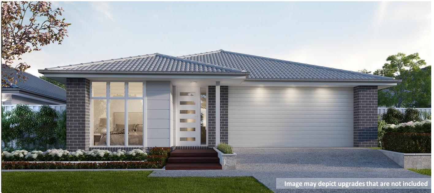
Image may depict upgrades that are not included

Floor area: 199.41m 2 / 21.47sq | Block Size: 560m 2 Address: Lot 521 Maslin Close, Seascape Estate, Diamond Beach