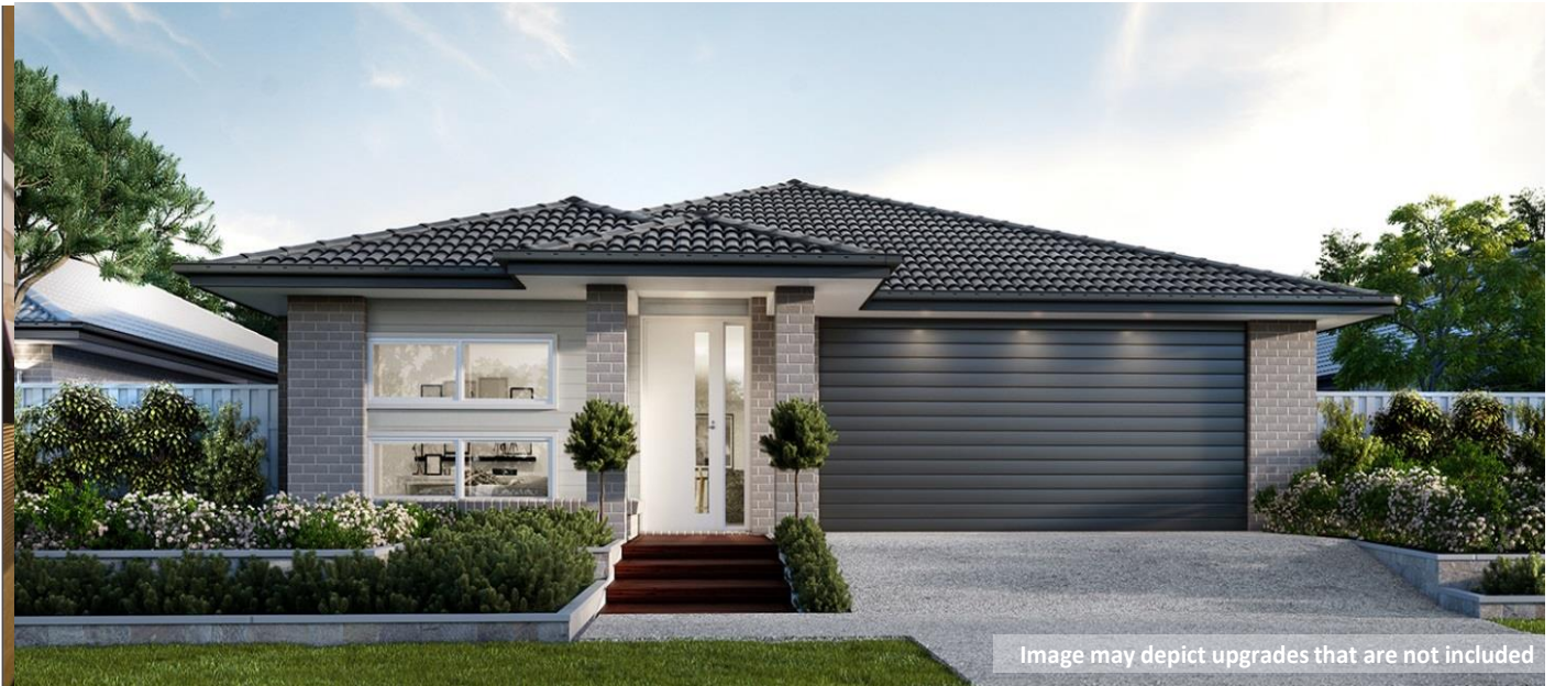
Image may depict upgrades that are not included

Floor area: 194.91m 2 / 20.98sq | Block Size: 619.7m 2 Address: Lot 532 Maslin Close, Seascape Estate, Diamond Beach